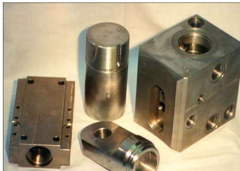
Hydraulic and Heavy Equipment Components