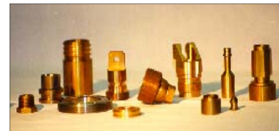
Small Hydraulic Components