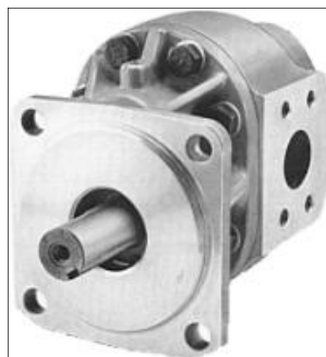
Hydraulic Pump Assembly