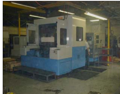
CNC Horizontal and Vertical Machining