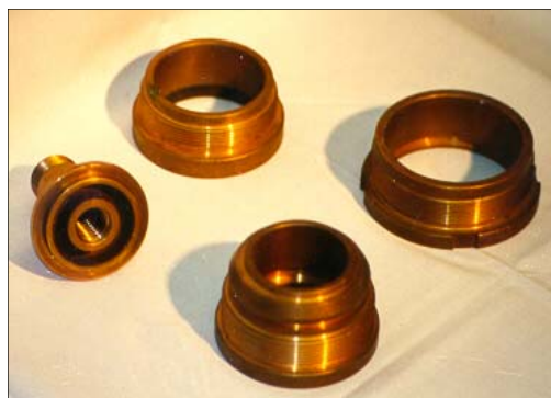
Hydraulic Pump Components