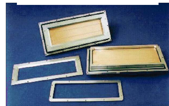
Close Tolerance Machining in Exotic Materials