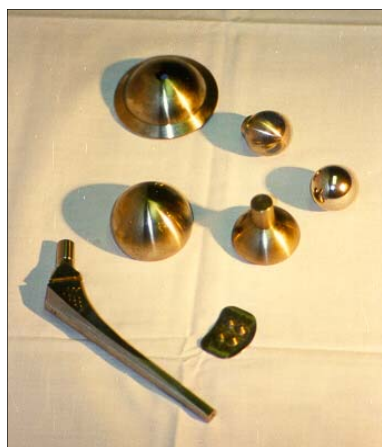
Medical Implants (Hip, Cup, Cap, Spinal Disc)